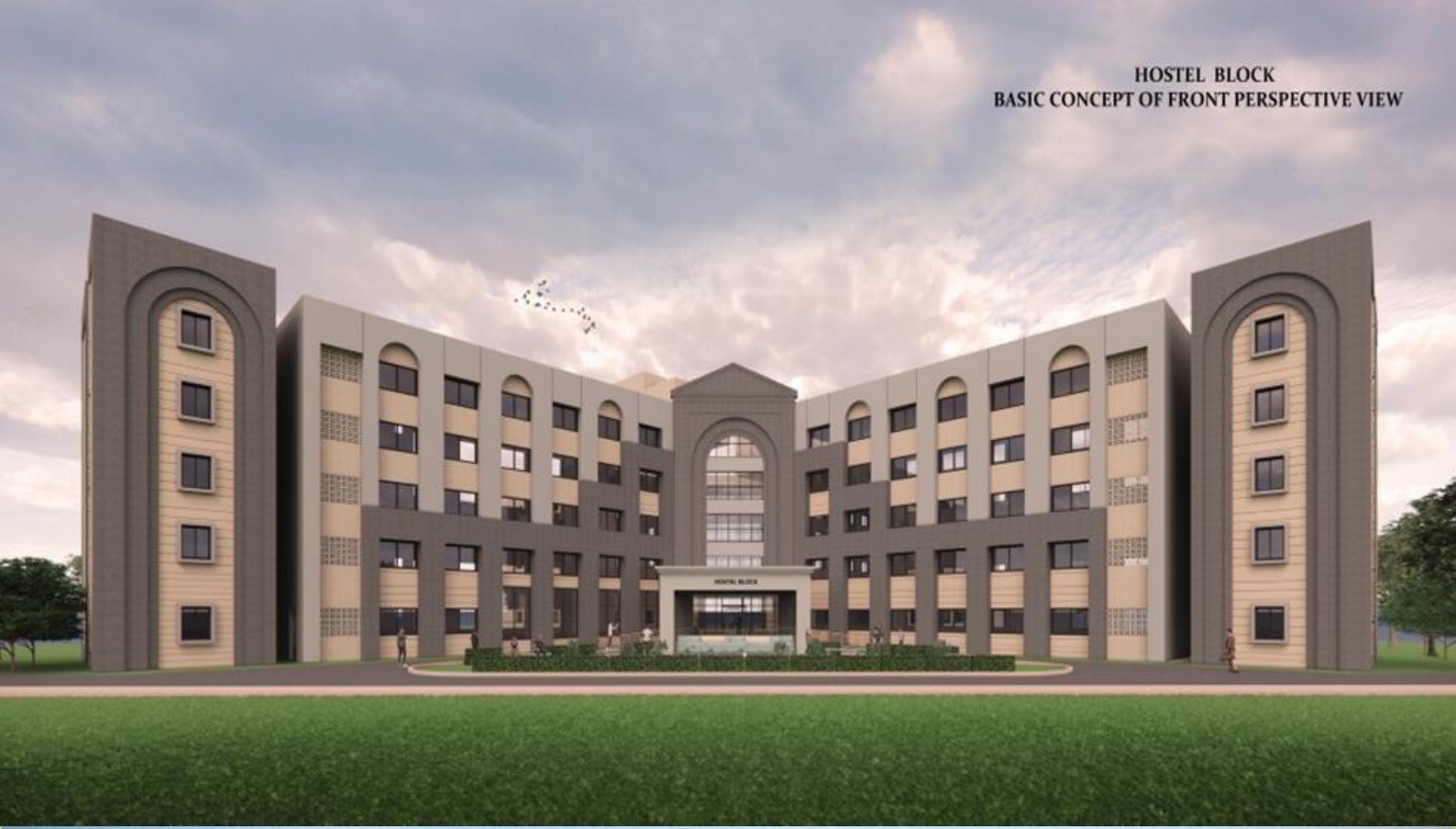
HOSTEL BLOCK BASIC CONCEPT OF FRONT PERSPECTIVE VIEW