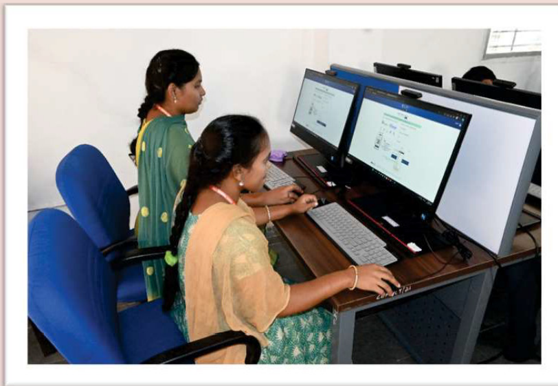
Students utilising the facilities of Viksit Bharat Digital Ideation Centre at CUAP ICT Centre

Faculty Awareness Sessions: Recognizing the crucial role of educators, each Department's faculty have conducted comprehensive sessions, informing the background and objectives of Viksit Bharat@2047: Voice of Youth campaign to the students. This ensures widespread understanding and encourages active participation.