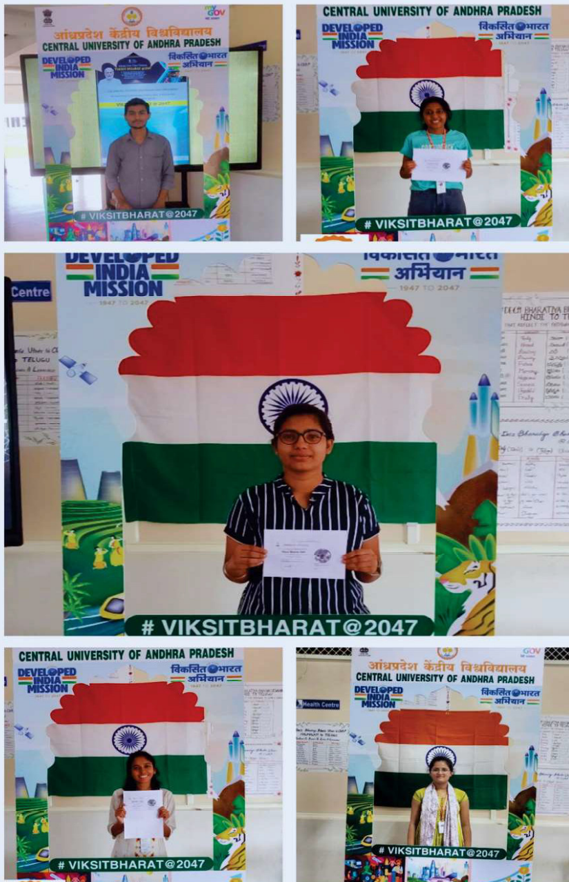
Students participated in Viksit Bharat pledge and quiz competition