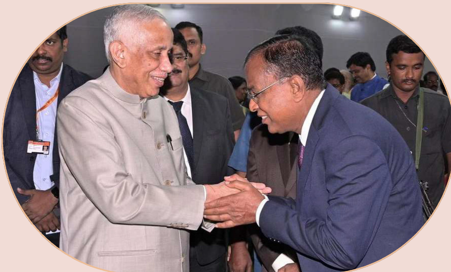
Hon'ble VC of Central University of Andhra Pradesh met the Hon'ble Governor of AP at inauguration of "Viksit Bharat@2047: Voice of Youth" addressed by Hon'ble Prime Minister Narendra Modi.