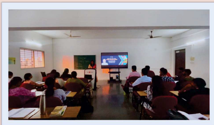
The Department of English organised student seminar on the theme of “Digital Empowerment” in the context of Viksit Bharat@2047.