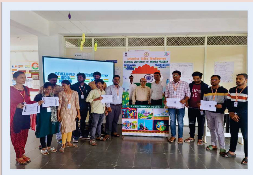
Faculty and students of Department of Economics gathered at Selfie booth post seminar.