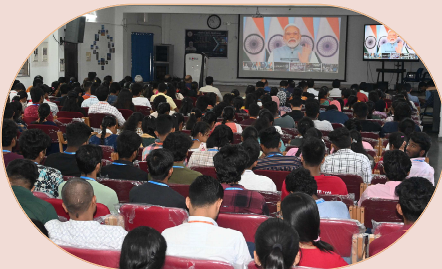
Students of Central University of Andhra Pradesh actively participated in inauguration of Viksit Bharat@2047: Voice of Youth addressed by Hon'ble Prime Minister Narendra Modi.

The Central University of Andhra Pradesh (CUAP) witnessed enthusiastic participation of the students in the inauguration ceremony of Viksit Bharat@2047: Voice of Youth, a nationwide initiative aimed at harnessing the power of young minds in building a developed India by 2047. The event was graced and addressed by Hon'ble Prime Minister Narendra Modi virtually. He emphasized on the crucial role of youth in shaping the nation's future and stated, "This is the period in history of India when the country is going to take a quantum leap." He further stated, "Youth power is both the agent of change and also the beneficiaries of change, and the roadmap of progress will not be decided by the government alone but by the nation."